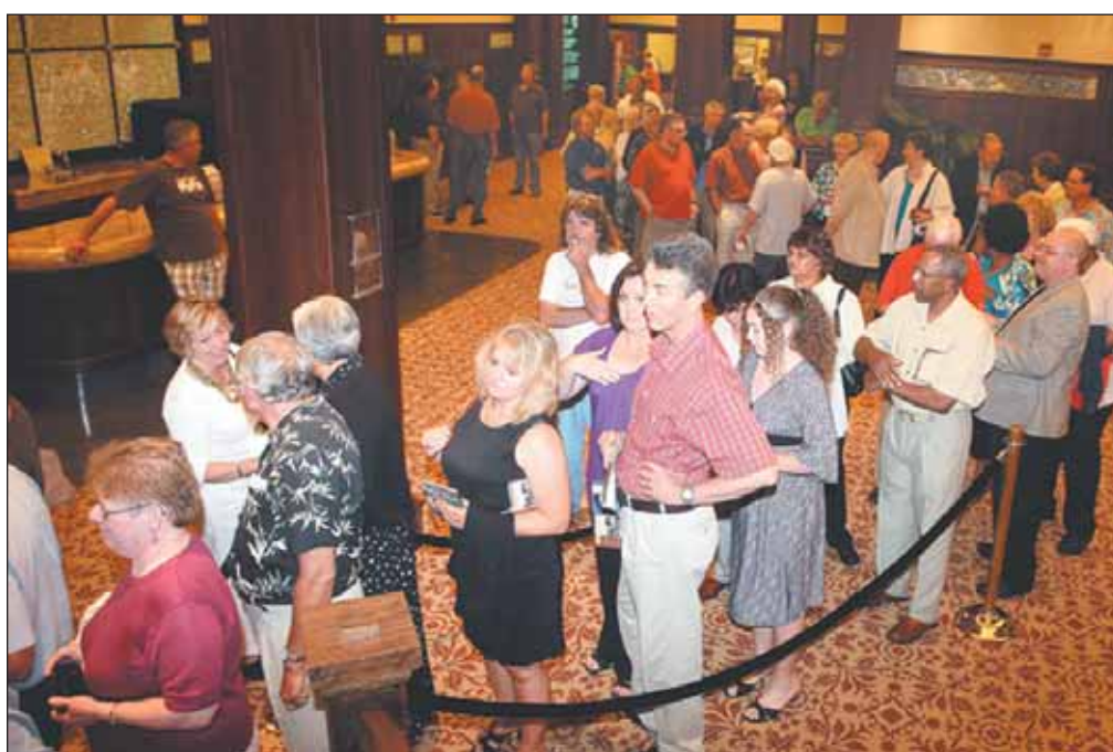
Concert-goers line up to meet Ahmad Jamal following his jazz performance at the Majestic Theater on Saturday night.