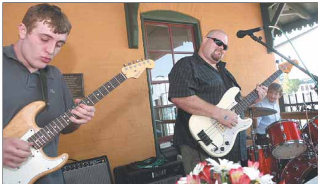
Phipps and Phriends provide bluesy tunes during the Festival's Blues, Beer and Barbecue event which set the stage for Saturday evening's performance by jazz musician Ahmad Jamal.