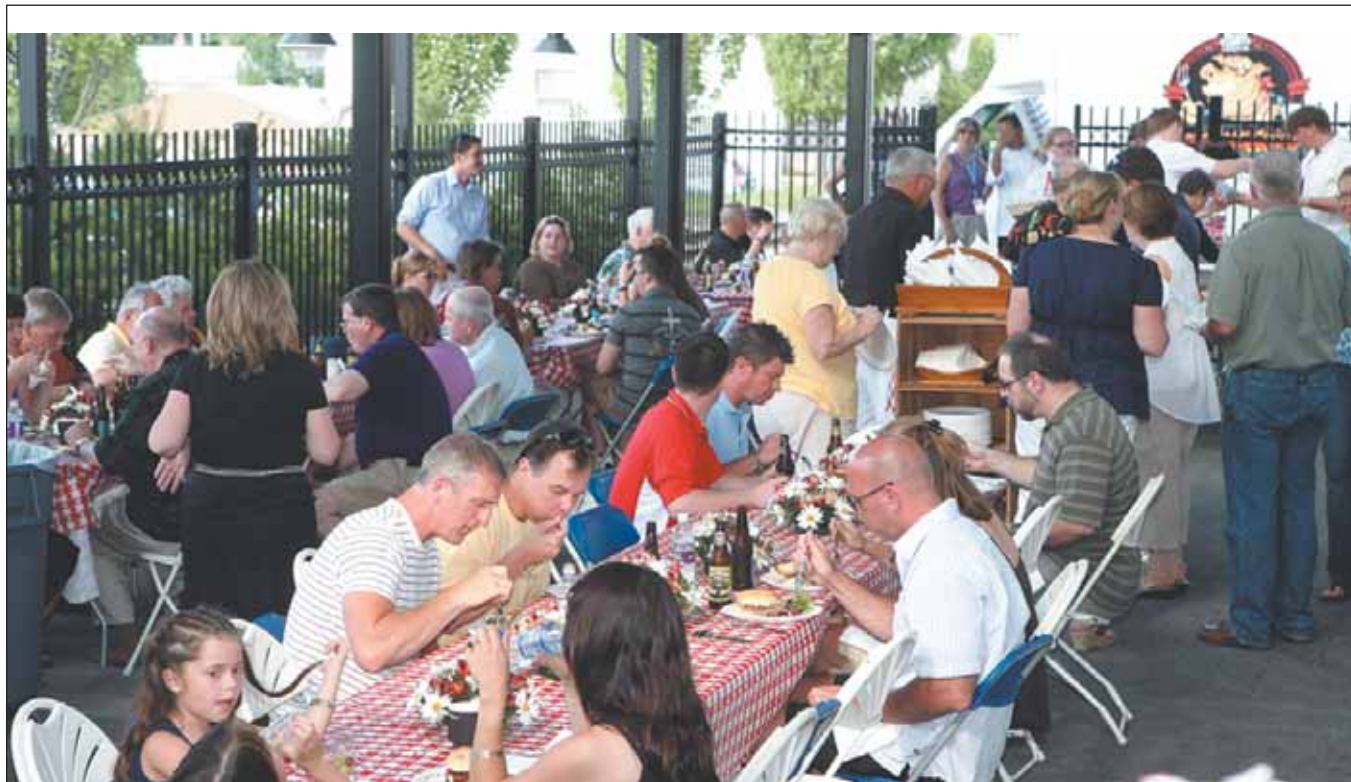
Folks gather in the pavilion of the Railroad Station to enjoy Blues, Beer and Barbecue Saturday afternoon.