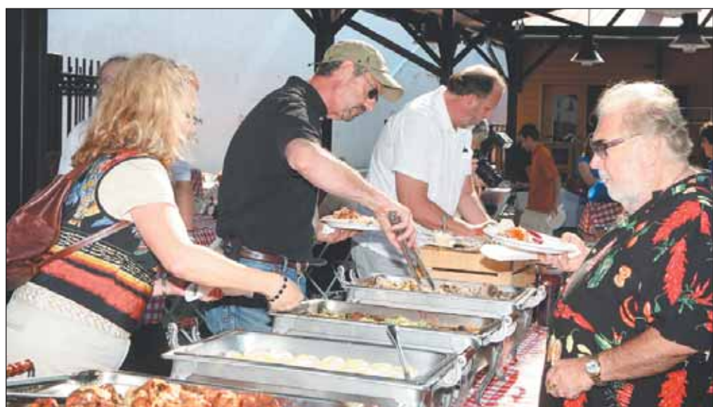
A tasty spread of food and some of Pennsylvania's best craft beer was enjoyed at the Railroad Station Pavilion on Saturday